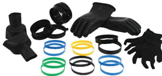
Bayonet glove ring incl wrist cuffs H gloves