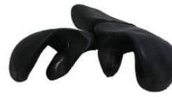
VIKING™ 2-finger rubber mittens

* Heavy-duty mittens suitable for commercial diving operations.