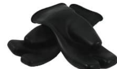
VIKING™ 3-finger latex mittens