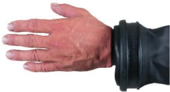
Rubber cuff ring with inner ring