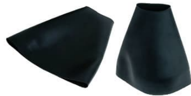
Short PRO cuffs