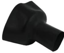
Bellows latex cuffs