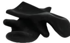
VIKING™ 2-finger latex mittens