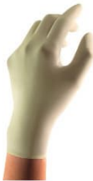
Inner comfort glove