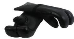
VIKING™ 3-finger rubber mittens